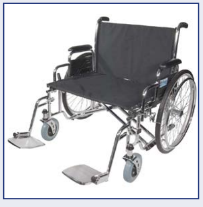
BARIWC28 28" Wheelchair