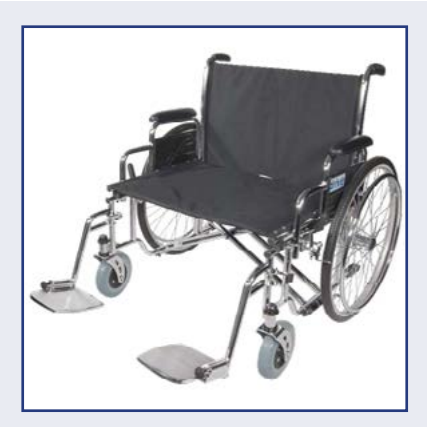
BARIWC26 26" Wheelchair