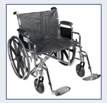
BARIWC22 22" Wheelchair