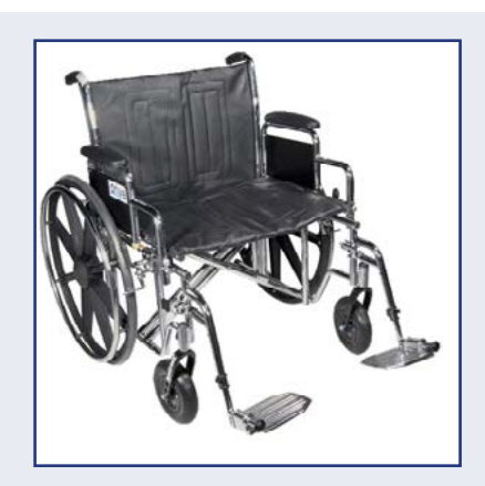
BARIWC24 24" Wheelchair